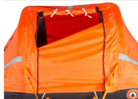
Free board can be increased

Sea-Safe ProLight PLSR OFFSHORE SELF-RIGHTING LIFERAFT